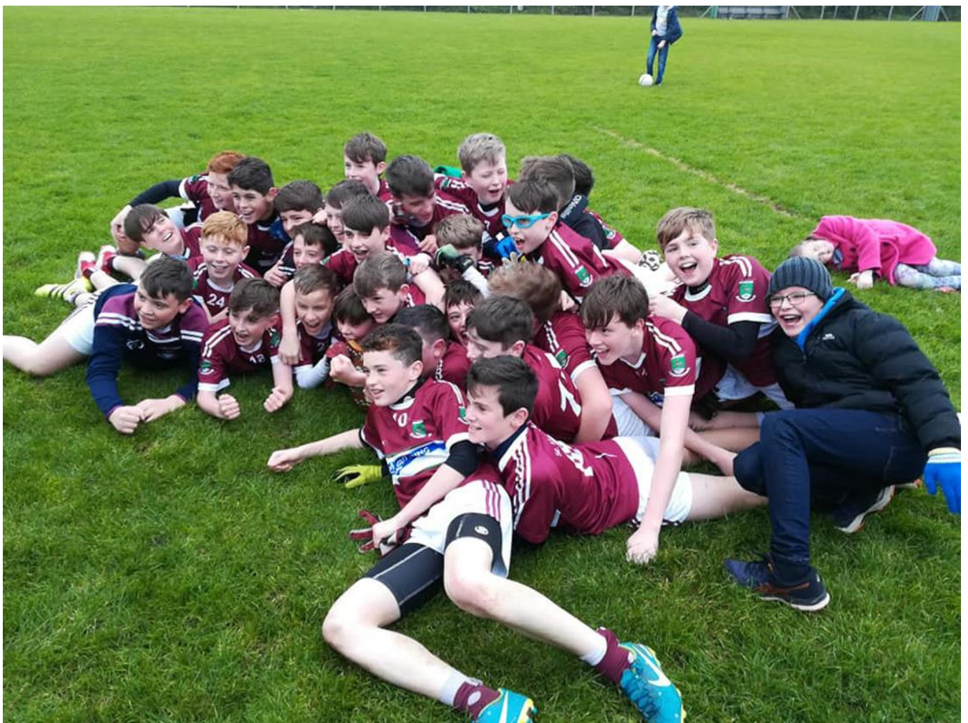
Tempo Maguires – U13 Division 2 Winners 2018

Féile Peil na nÓg will take place on 29 th and 30 th June 2019. The requirement for the number, and standard, of teams representing Fermanagh will be determined by the National Féile committee in due course. This will determine the competition structure put in place in Fermanagh.