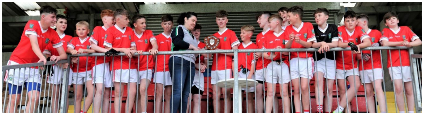
Newtownbutler First Fermanaghs – U15 A FC & U15 FL Div 1 Winners 2018

The Rounds of Fixtures for the U15 Football League will be confirmed once the number of teams taking part is known and the gradings decided. This will be communicated no less than 14 days before the beginning of the competition.