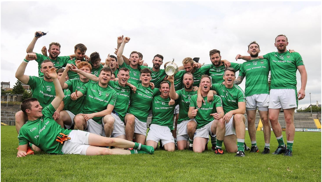
Roslea Shamrocks – Erne Cup 1 Winners 2018