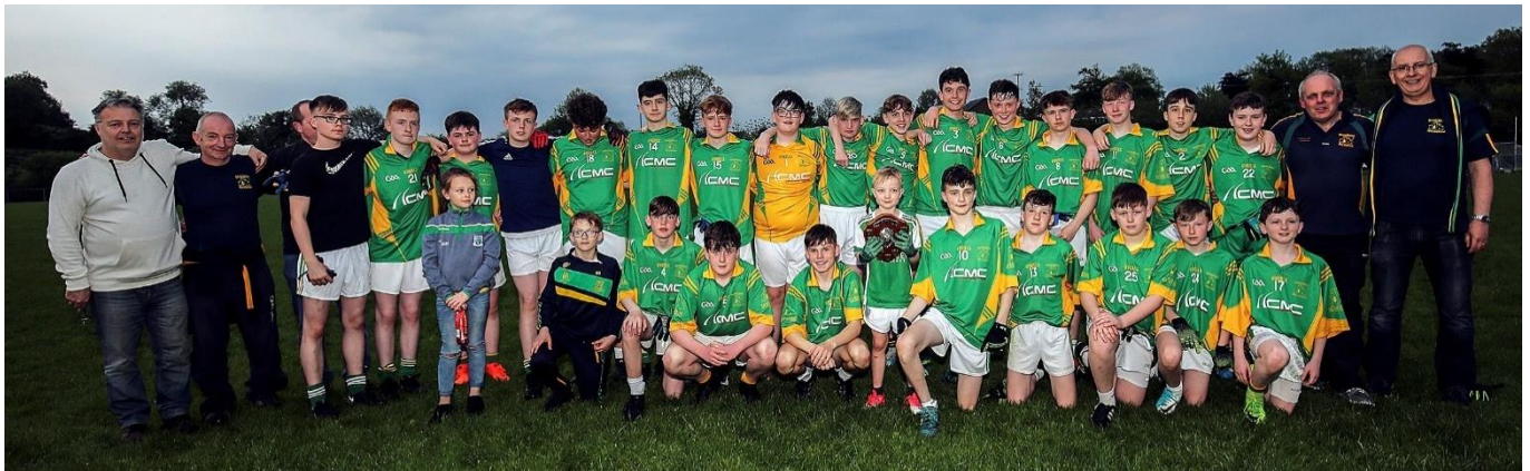
Irvinestown Naomh Molaise – U15 FL Div 2 Winners 2018

The draw for the U15 Football Championships will take place once the U15 Football League Finalists are known (Regulation 5).