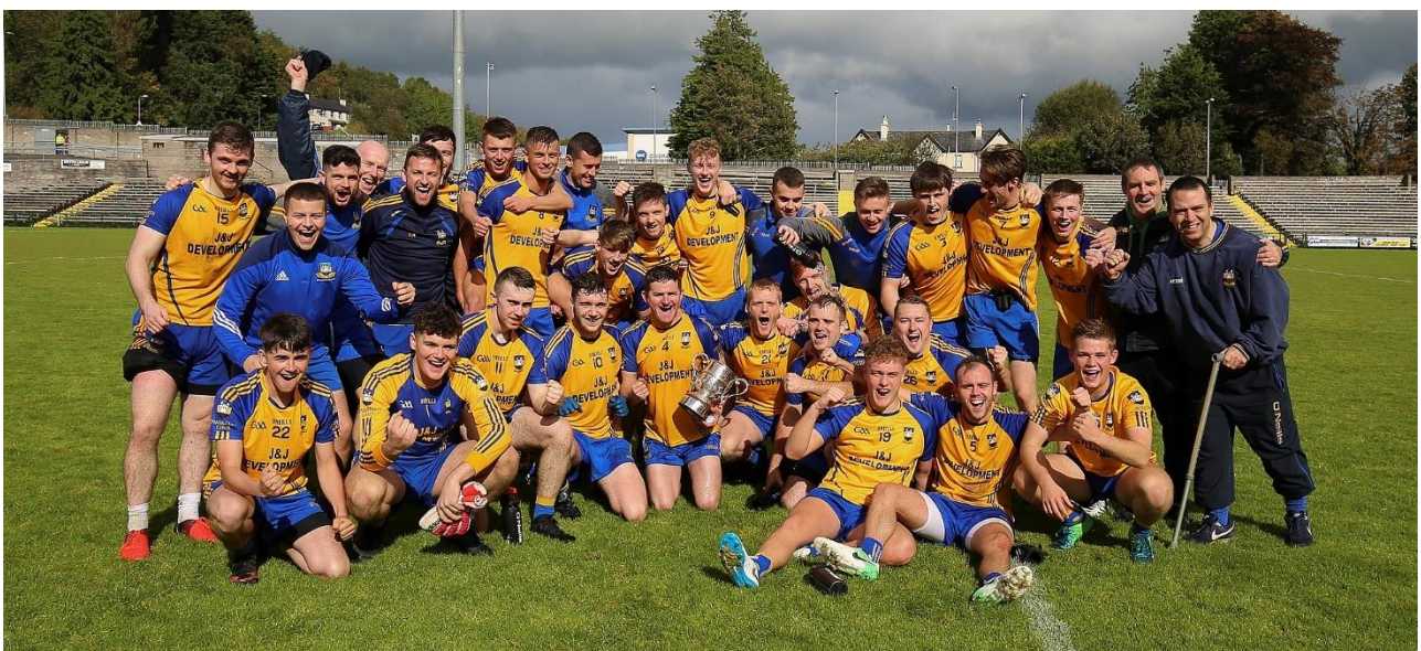
Enniskillen Gaels – RFC A Winners 2018

The dates for these games may be subject to change depending on replays in the SFC, IFC or JFC or on the make-up of the teams in the finals and their continued involvement in the SFC, IFC or JFC at that stage.