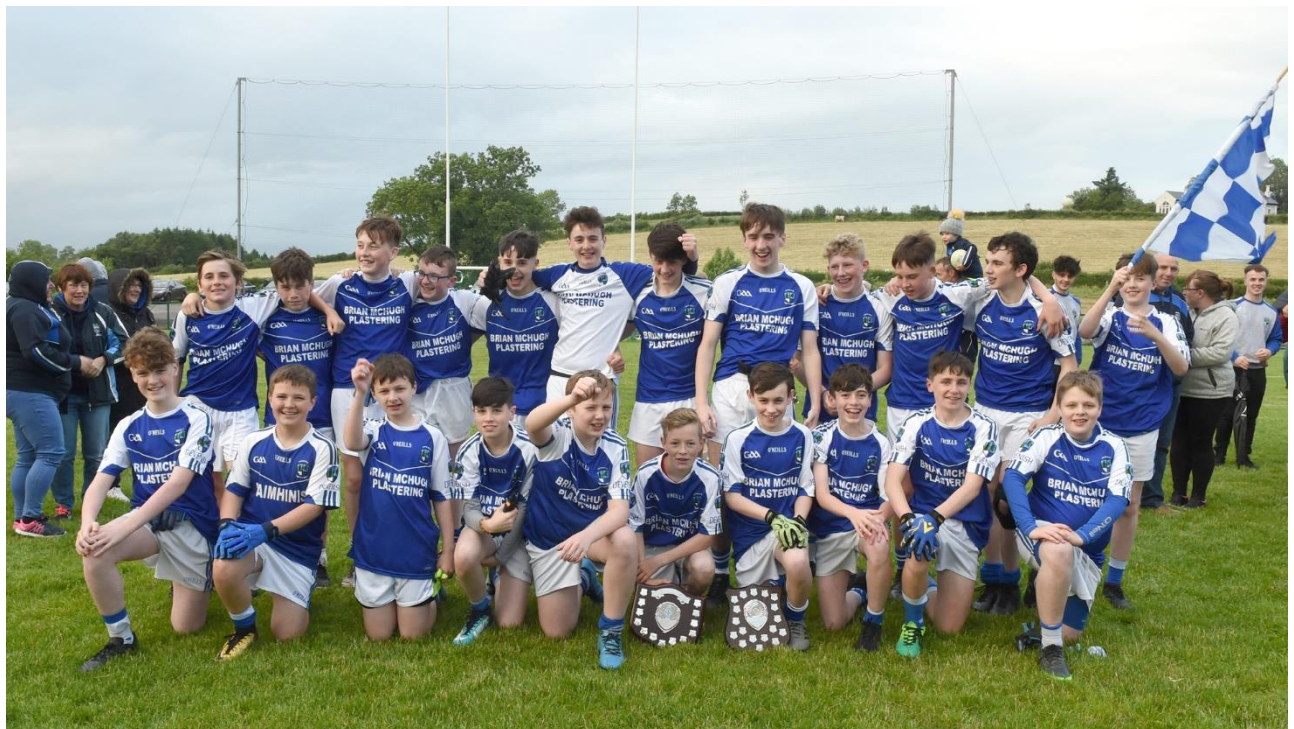
Devenish St Mary's – U15 B FC & U15 FL Div 3 Winners 2018