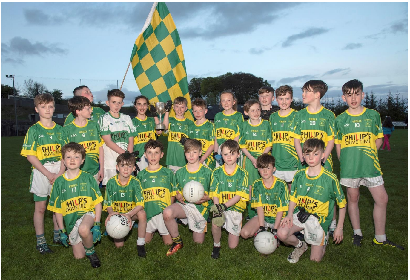
Irvinestown Naomh Molaise – U12 Division 1 Winners 2018

The Rounds of Fixtures for the U11.5 Football League will be confirmed once the number of teams taking part is known and the gradings decided. This will be communicated no less than 14 days before the beginning of the competition.