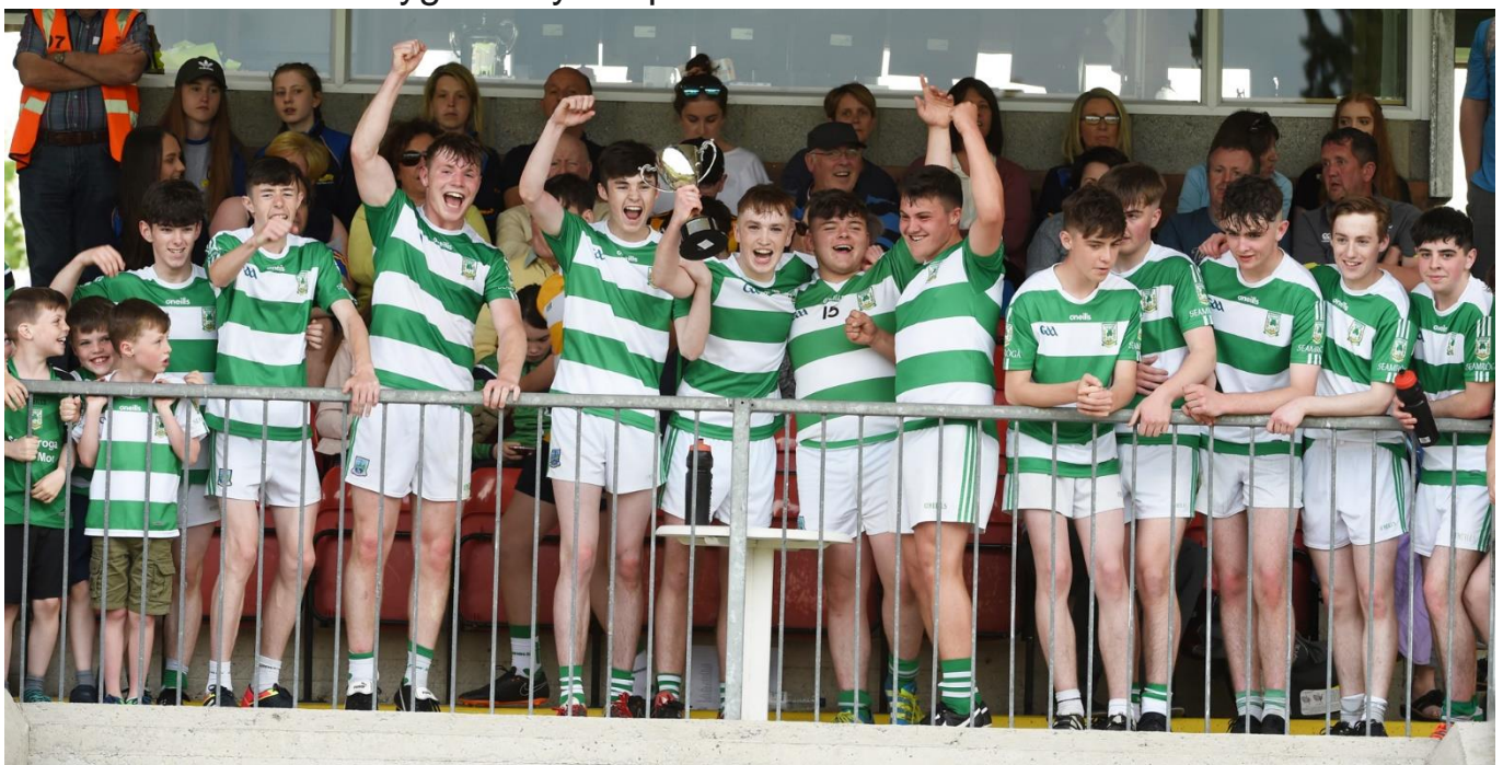
Teemore Shamrocks – U18 B FC Winners 2018