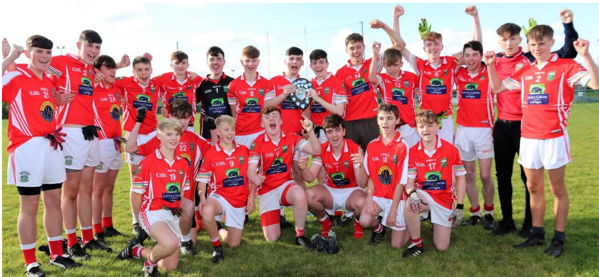
Newtownbutler First Fermanaghs – U17 FL Division 3 Winners 2018

The draw for the U15 Football Championships will take place once the U15 Football League Finalists are known (Regulation 5).