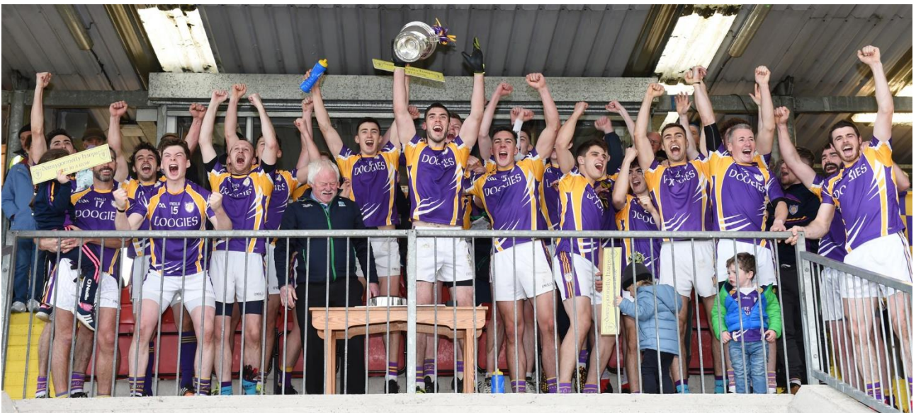
Derrygonnelly Harps – SFC Champions 2018