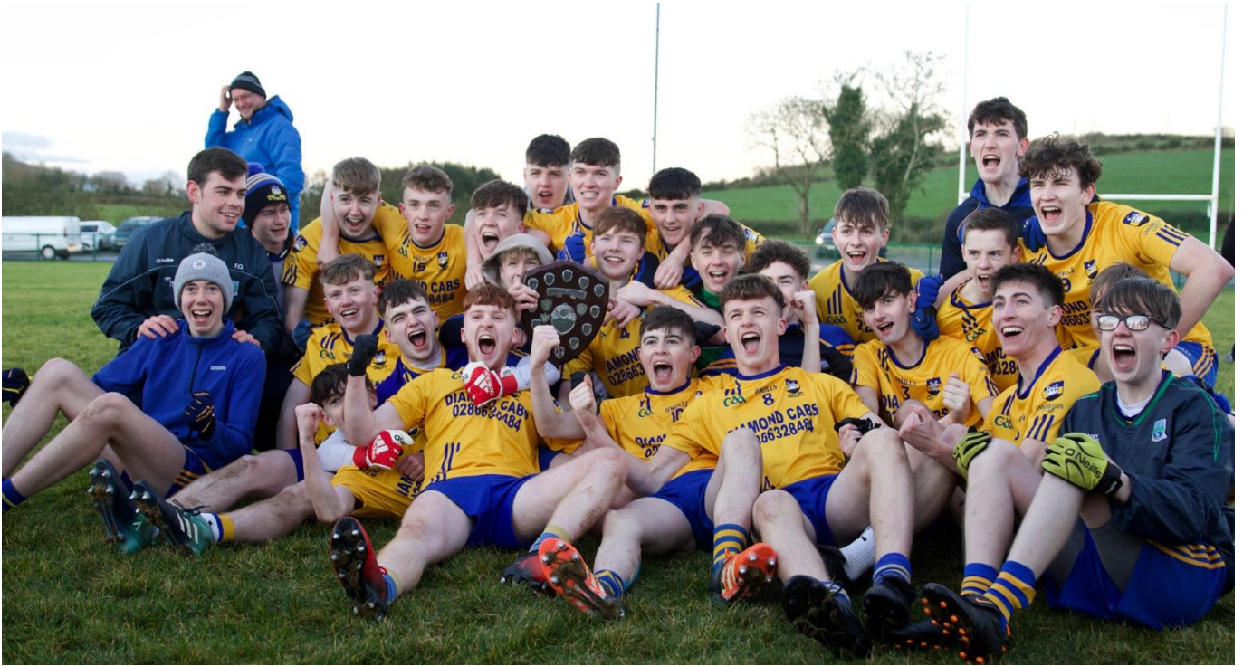
Enniskillen Gaels – U17 A FC Winners 2018