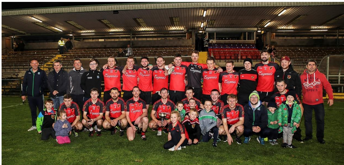
Maguiresbridge St Mary's – SFL 3 Winners 2018