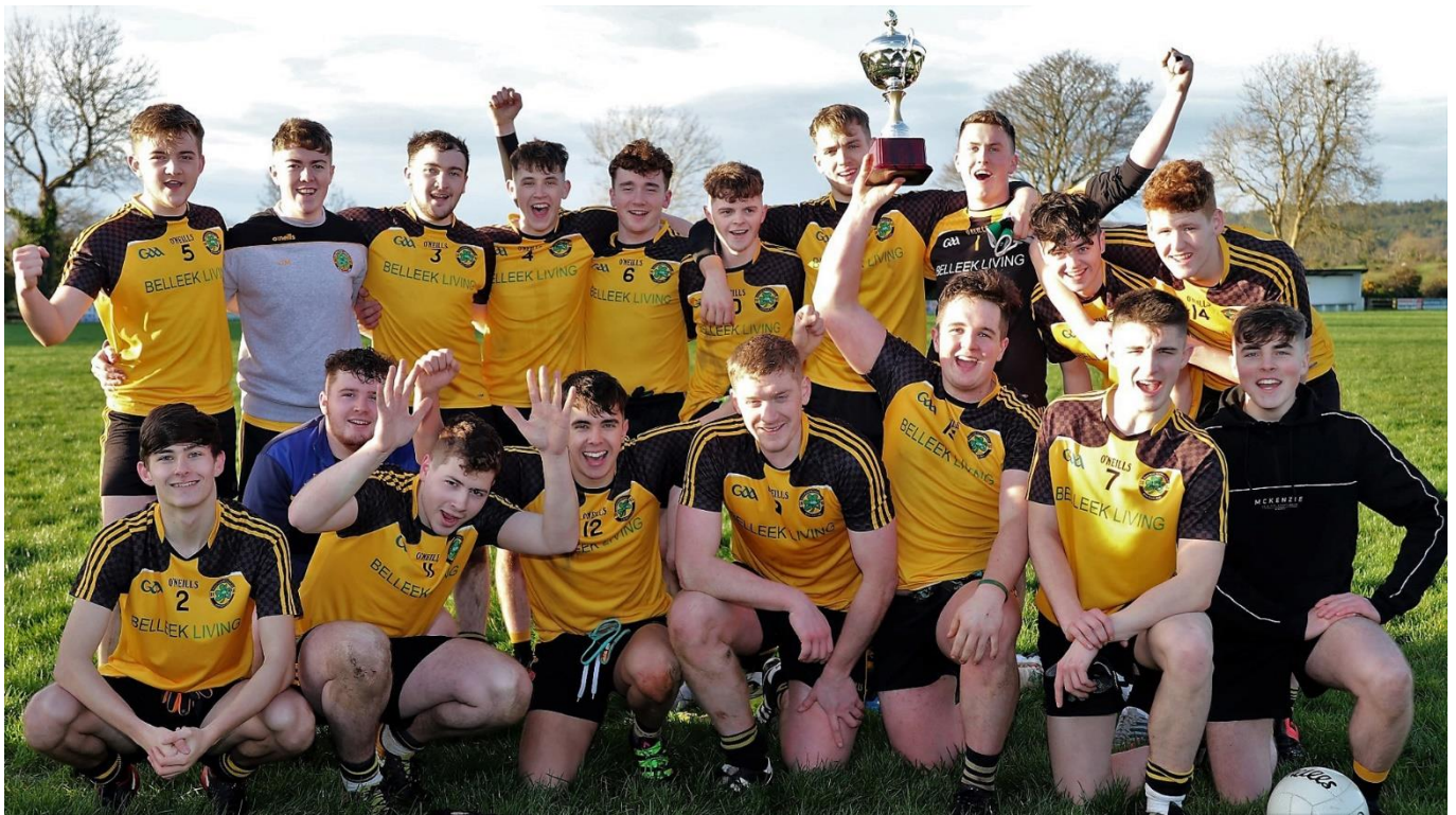
Erne Gaels - U21 B FC Winners 2018