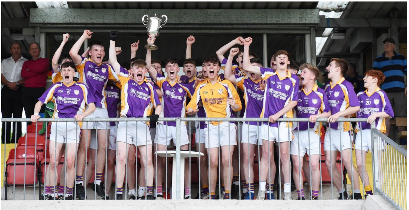
Derrygonnelly Harps – U18 A FC Winners 2018

We have continued the practice of setting Monday evenings aside for hurling and for ladies football within the county. No games are being organised for Monday evenings and clubs are once again asked not to arrange training for Monday evenings.