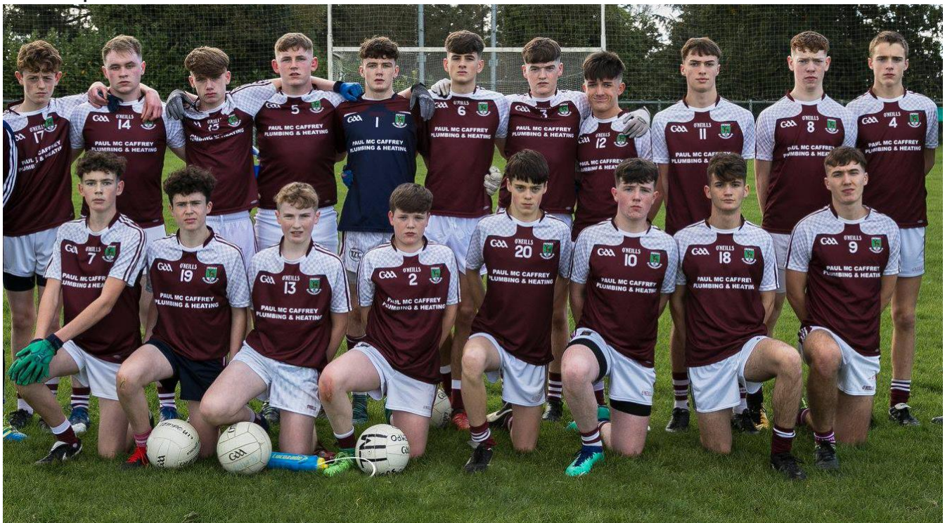
Tempo Maguires – U17 FL Division 2 Winners 2018

The Rounds of Fixtures for the U17 Football League will be confirmed once the number of teams taking part is known and the gradings decided. This will be communicated no less than 14 days before the beginning of the competition.