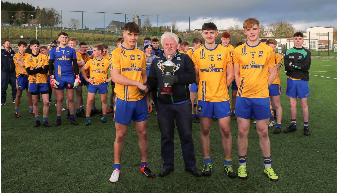
Enniskillen Gaels - U21 A FC Winners 2018

their amendment or deletion shall quote the number of the regulation to be amended or deleted. Fermanagh GAA regulations shall be reviewed annually.